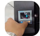
TIME SETTING WINDOW