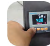
TEMP. SETTING WINDOW